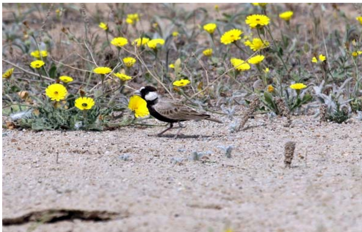
Figure 14. A male Black-crowned Sparrow-Lark ( Eremopterix nigriceps ), of eastern race melanauchen at Kabd (Sulaibiya Agricultural Research Station).

find Dunn's Lark ( Eremalauda dunnii ), but no one showed up. Black-crowned Sparrow-Larks ( Eremopterix nigriceps ) of the eastern race melanauchen were quite common and we saw c. 20 of this uncommon breeder ( Fig. 14 ).