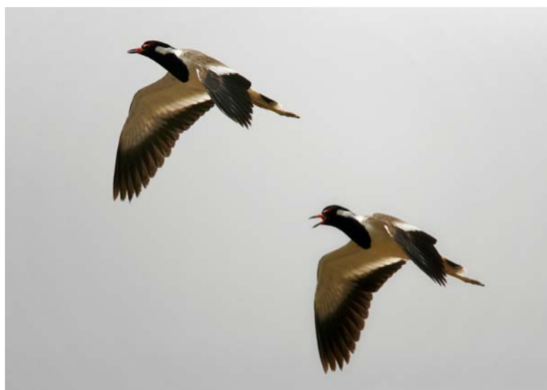
Figure 10. Red-wattled Plover ( Hoplopterus indicus ). The area of Abdali Farms close to the Iraq border is probably the best in the Western Palearctic to get this species.

We continued further north and close to Abdali Farms immediately at the Iraq border, where we saw two Red-wattled Plover ( Hoplopterus indicus ) along the road close to a watchtower ( Fig. 10 ). This area is probably the best in the Western Palearctic to get this species.