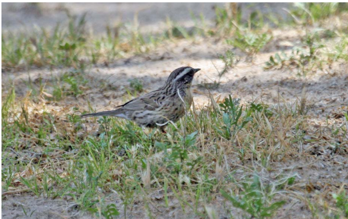
Figure 17. The find of a Black-crowned Accentor ( Prunella ocularis ) in the oasis at Al Abraaq Al-Khabari, was the first ever for Kuwait.

This time all of us also got a good view at the African Collared Dove ( Streptopelia roseogrisea ) sitting in a high tree, where we clearly could see the white belly in contrast to darker breast. A secretive Shikra ( Accipiter badius ) gave us problem, because there was also five Eurasian Sparrowhawks hiding in the trees, so we had to check every flying Sparrowhawk carefully. At least three Eastern Orphean Warblers ( Sylvia crassirostris ), four Ménétries's Warblers ( Sylvia mystacea ), two Upcher's Warblers ( Hippolais languida ), one Pale Rockfinch ( Carpospiza brachydactyla ) and five White-throated Robin ( Irania gutturalis ) was found ( Fig. 1 ). A Greater Spotted Eagle ( Aquila clanga ) passed the oasis. Five Cattle Egrets ( Bubulcus ibis ) roosted in a tree. A surprise was a flock of Western Reef Heron ( Egretta gularis ) in the oasis far from the sea. We also found e.g. a European Scops Owl ( Otus Scops ) hiding in a tree, a few Gray Wagtail ( Motacilla cinerea ) and four Semi collared Flycatcher ( Ficedula semitorquata ). We ended the day with a visit to Jahra East Outfall (site 14) , which we thought was the best place to find Basra Reed Warbler ( Acrocephalus griseldis ). We spent an hour between 17 15 and 18 15 at the site, but had no luck this time either.