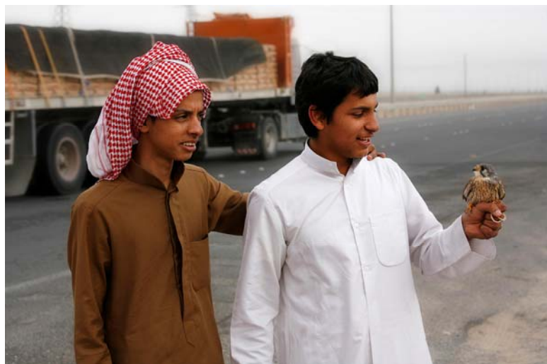
Figure 9. Two young Kuwaitis showing their Kestrel. ( Falco tinnunculus ).

We started 06 00 for a visit to Abdali Farms (site 1) in the northern part of Kuwait, close to the border of Iraq with the aim to find Red-wattled Plover ( Hoplopterus indicus ) and Common Babbler ( Turdoides caudatus ). We made a first stop at Rawdatain (site 26) , an oasis south of Abdali which use to attract migrant birds, but we saw just a few like Isabelline Shrike ( Lanius isabellinus ), Black-crowned Night Heron ( Nycticorax nycticorax ), a European Wryneck ( Jynx torquilla ) and a dead Indian Silverbill ( Euodice malabarica ). Along the road, we stopped for breakfast at a restaurant with local food. Outside the restaurant we meet two young Kuwaitis which proud showed a Kestrel ( Falco tinnunculus ) ( Fig. 9 ).