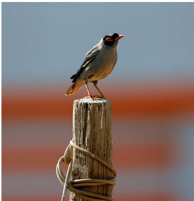
Figure 7. Bank Mynah ( Acridotheres ginginianus ) in Jahra City.

We ended up the day with Doha Peninsula (site 7) , west of Kuwait City, an area of harbours, mudflats and sabkha (Arabic name for salt-flat which is very saline areas of sand or silt lying just above the water table). The most interesting species here was the flock of 200 Crab Plover ( Dromas ardeola ) ( Fig. 8 ).