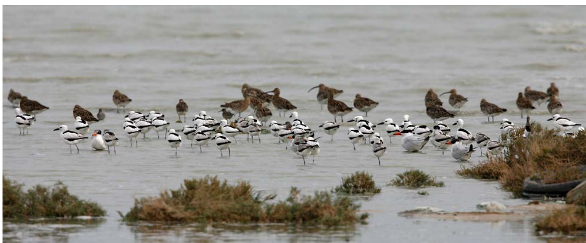
Figure 8. Crab Plover ( Dromas ardeola ) at Doha Peninsula (site 7).

We ended up the day with Doha Peninsula (site 7) , west of Kuwait City, an area of harbours, mudflats and sabkha (Arabic name for salt-flat which is very saline areas of sand or silt lying just above the water table). The most interesting species here was the flock of 200 Crab Plover ( Dromas ardeola ) ( Fig. 8 ).