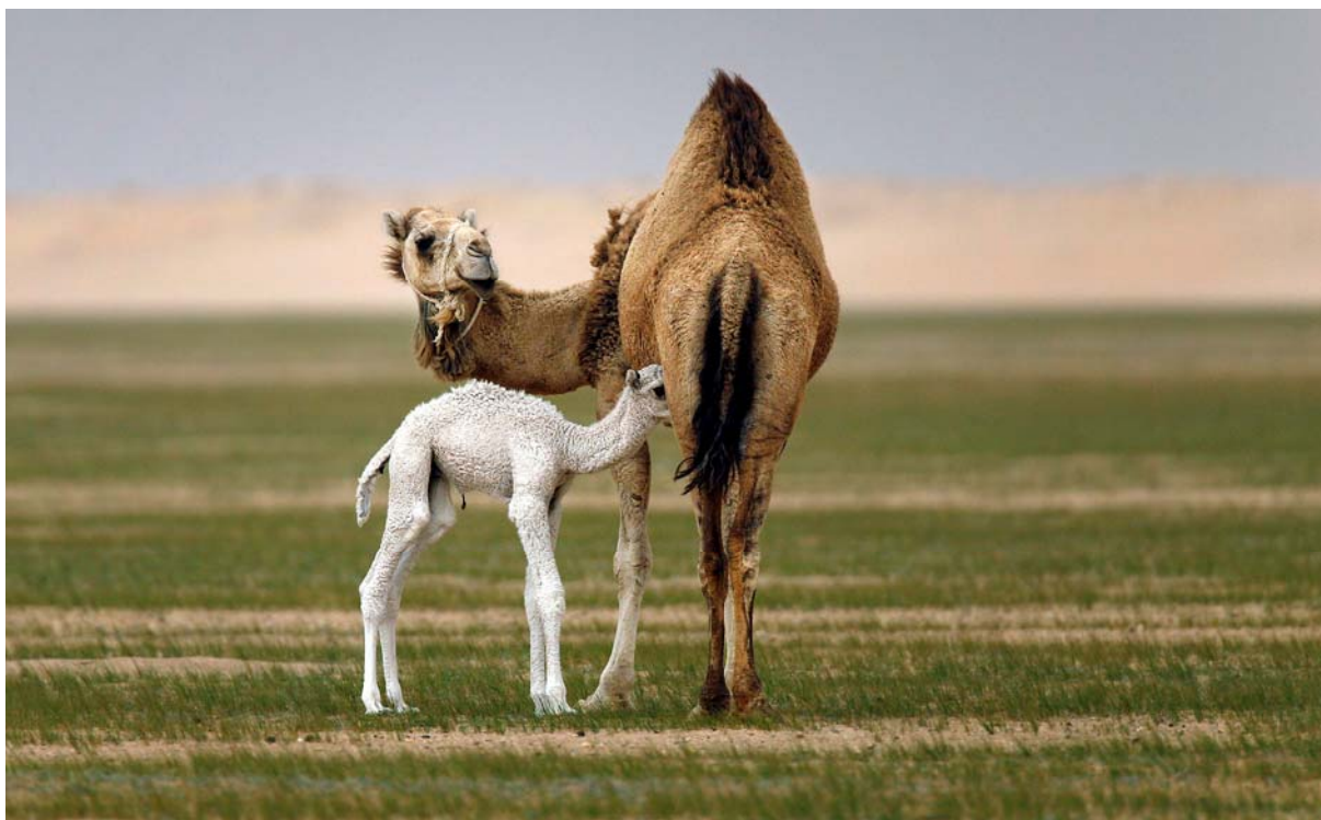
Figure 15. A dromedary with a child close to the Al-Abraq Al-Khabari oasis (site 2).