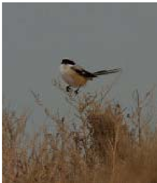
Figure 4. Long-tailed Shrike ( Lanius schach ), second record for Kuwait, and the fourth in Western Palearctic

Our first stop was Sulaibikhat Nature Reserve (site 32, cf. Fig 3.) . This is a small fenced reserve, managed by the Kuwait Environment Protection Society (KEPS), along the shore of Sulaibikhat Bay on the western side of Kuwait City. The trees, bushes, ground vegetation and freshwater pools attract many migrants and breeding birds in spring and summer. Our target species was Long-tailed Shrike ( Lanius schach ) ( Fig. 4 ), a winter visitor from the east. The bird, second record for Kuwait and the fourth in Western Palearctic, was soon located in a shrub. Another target, White-cheeked Bulbul ( Pycnonotus leucogenys ), was common in the area, where also the first breeding of this species was noted in 1972 ( Fig. 5 ).