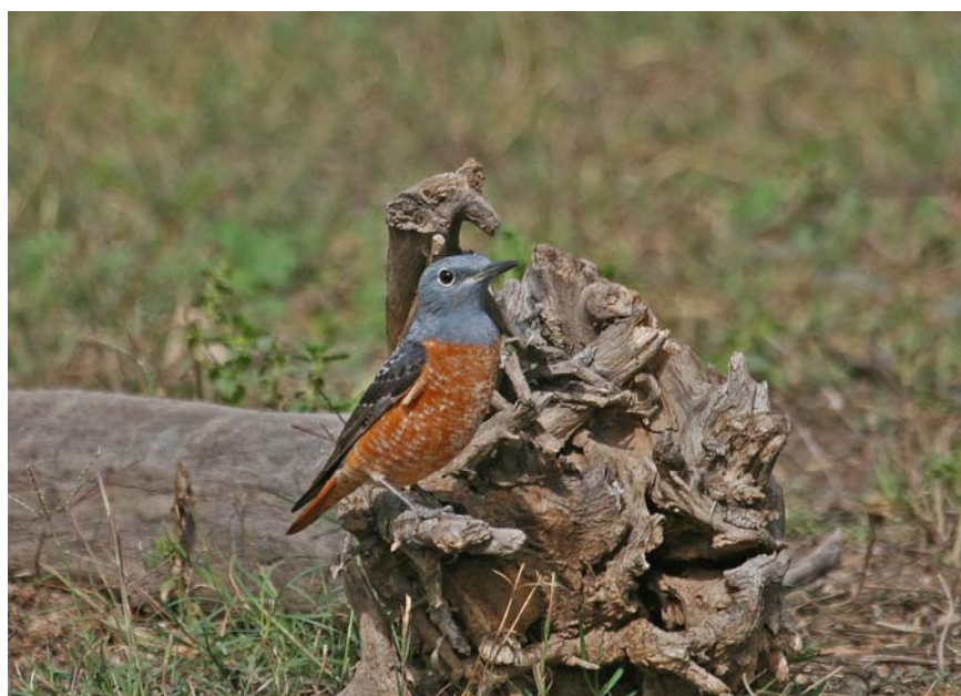
Figure 16. Rufous-tailed Rock Thrush ( Monticola saxatilis ) at Sabah Al-Salem (site 28).