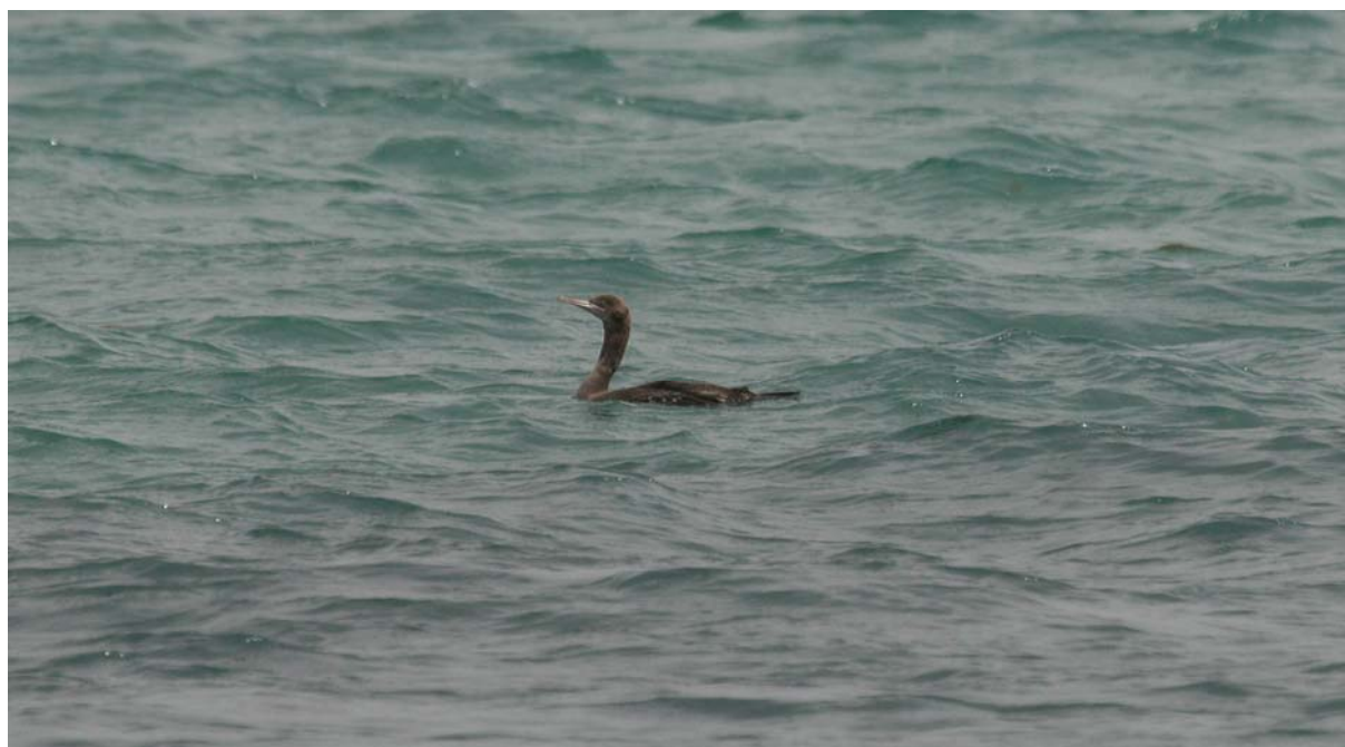
Figure 13. Juvenile Socotra Cormorant ( Phalacrocorax nigrogularis ) at Zour Port, Kuwait, March 22, 2007.

We continued south along the coast to Zour Port (site 37) , a fenced oil terminal. George had fixed permit for us to get in at Zour, a village along the shore with residences for foreign families to oil workers. This site is the best for Socotra Cormorant ( Phalacrocorax nigrogularis ) which usually is present offshore between March and September. We found two on a skerrie, together with Great Cormorants ( Phalacrocorax carbo ) Lesser Crested Terns ( Sterna bengalensis ) and two White-cheeked Terns ( Sterna repressa ). Additionally two juveniles Socotra Cormorant were fishing close to the shore which satisfied the photographers in the group ( Fig. 13 ).