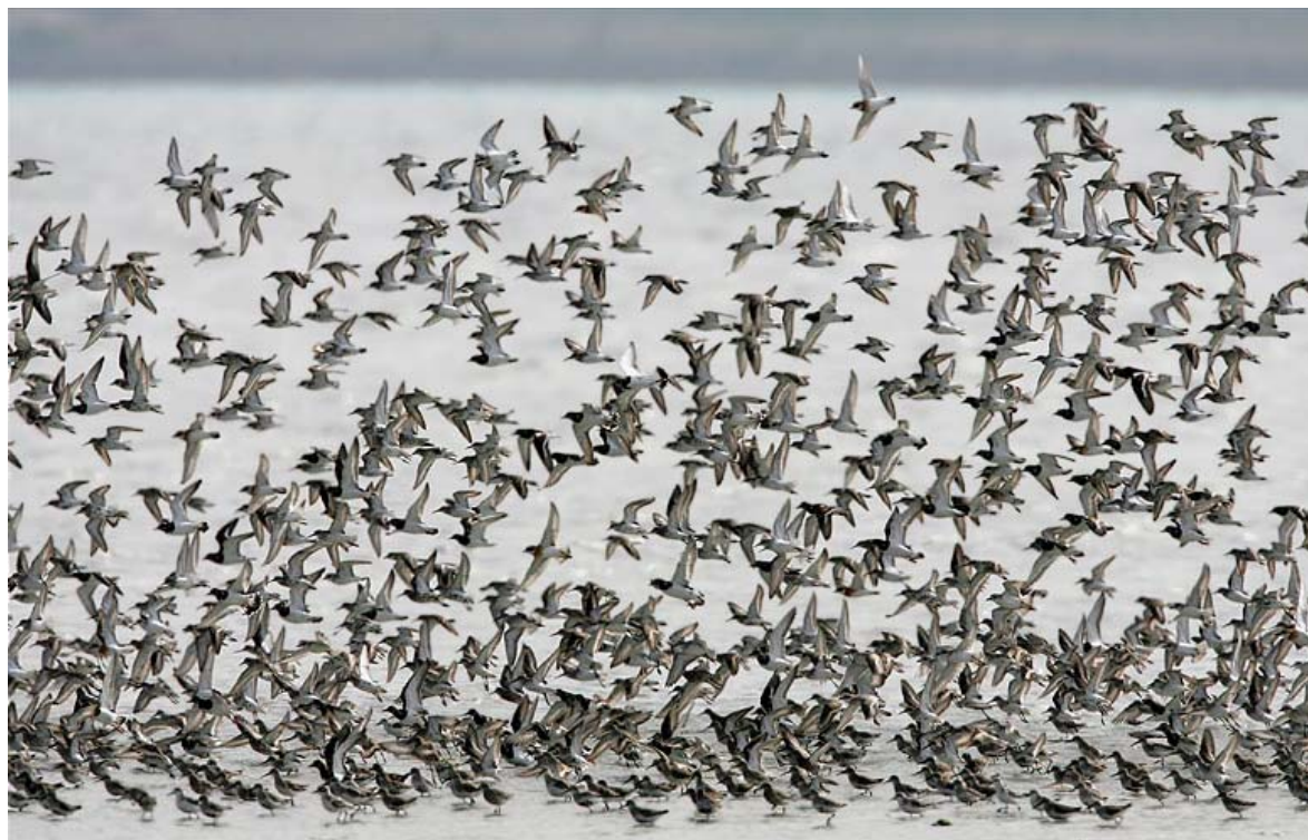
Figure 2. Waders, mainly Calidris at Doha Peninsula (site 7), March 24, 2007.