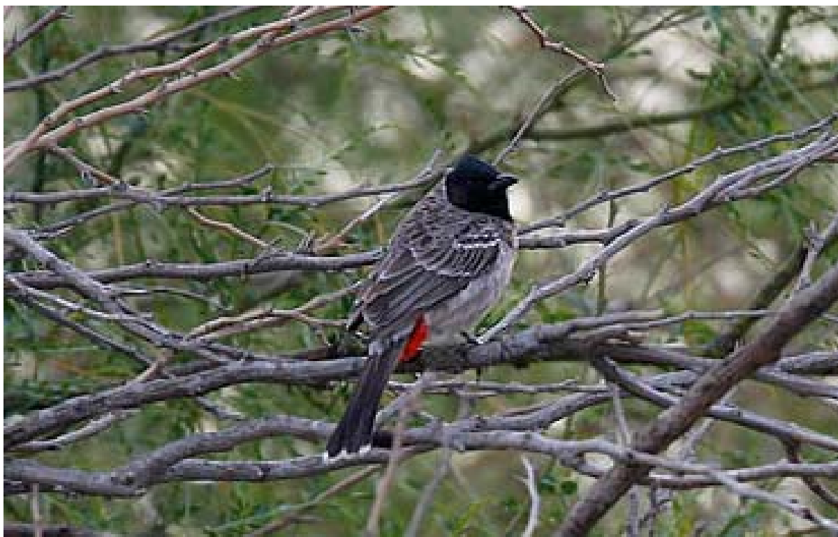
Figure 11. Red-vented Bulbul ( Pycnonotus cafer ) at Green Island. The species was first confirmed breeding in Kuwait 1986.