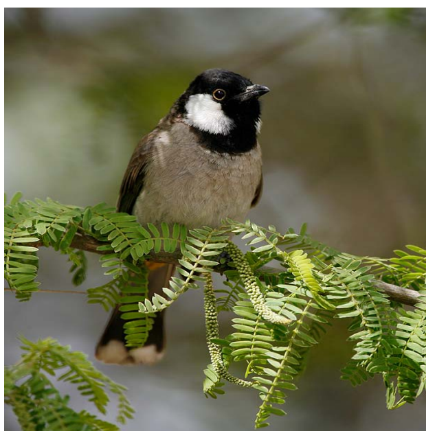
Figure 5. White-cheeked Bulbul ( Pycnonotus leucogenys ), was common in Sulaibikhat Nature Reserve (site 32).