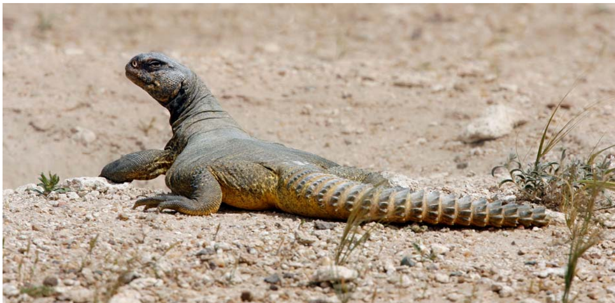
Figure 6. In the desert Spiny-tailed Lizard ( Uromastix aegyptia microlepis ), locally known as Dhubs, was common.

Next site was Sabah Al-Ahmed Natural Reserve (SAANR) (site 27) , a 320 km 2 fenced and guarded nature reserve north of Jahra City. For access needs permit. The reserve includes a large area of original semi-desert (main part of Kuwait is overgrazed by e.g. camels and goats), small wadis and an oasis at Tuhla. Larks and Wheatears, e.g. Lesser Short-toed Lark ( Calandrella rufescens ), Greater Hoopoe Lark ( Alaemon alaudipes ), Pied- and Black-eared Wheatear ( Oenanthe pleschanka , O. hispanica ) was common. At Tuhla, common passage migrants such as Barn- and Red-rumped Swallows ( Hirundo rustica , H. daurica ) together with Sand Martin ( Riparia riparia ) was flying above the water. Other migrants like Chiff-Chaff ( Phylloscopus collybita ), Grey Wagtail ( Motacilla cinerea ), Yellow Wagtail ( Motacilla flava ) of two races feldegg and beema ) was present. Close to the oasis we also saw a few Steppe Eagles and an Imperial Eagle ( Aquila nipalensis , A. heliaca ). In a wadi a female Ménétries's Warbler ( Sylvia mystacea ) was hiding in a scrub. In the desert Spiny-tailed Lizard ( Uromastix aegyptia microlepis ), locally known as Dhubs, was common. These up to a metre long reptiles looked like tree trunks on distance when they were looked up from their holes in the ground ( Fig. 6 ).