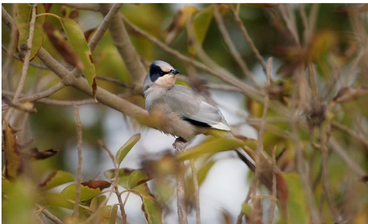
Figure 12. Grey Hypocolius ( Hypocolius ampelinus ) at Green Island. A difficult species to get in the Western Palearctic, but is recorded annually in Kuwait.