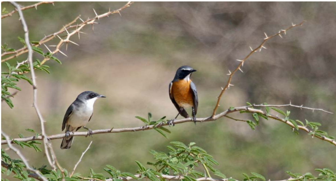
Figure 1. In an Acacia at Al-Abraq Al-Khabari, March 29, 2007, an Eastern Orphee Warbler ( Sylvia crassirostris ) and a White-throated Robin ( Irania gutturalis ) were sitting beside each other.